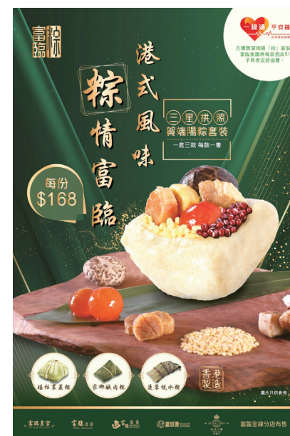
富臨集團 - 端陽糉慈善義賣 Fulum Group - Rice Dumpling Charity Sale

Corporate / organization / school can organize their own fundraising activities and name SCHSA as the beneficiary, such as Charity Ball and Fun Fair, to raise fund HK$25,000 or above. Let's work together to show unceasing loving care for the elderly who are less affluent.